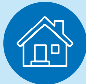
Housing and Accommodation