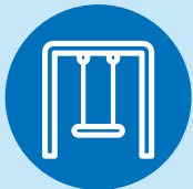
Community Amenity and Cohesion