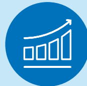
Economic Development, Employment and Skills Development