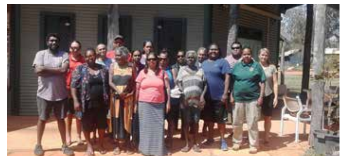
Members of the WAU Leadership Group outside the Lombadina office after a decision was made on their shared vision, name and slogan for the project.

*Woombooriny Aambooriny means 'people' in the local Bardi and Nyulnyul languages.