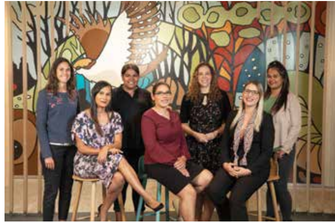
Members of the Woodside Indigenous Collegiate who enabled the integration of cultural recognition into the fabric of Mia Yellagonga.