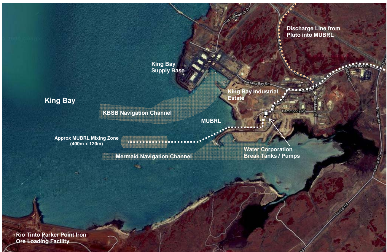
Figure 4-1 MUBRL Discharge Area and Surrounding Environment

This document is protected by copyright. No part of this document may be reproduced, adapted, transmitted, or stored in any form by any process (electronic or otherwise) without the specific written consent of Woodside. All rights are reserved.